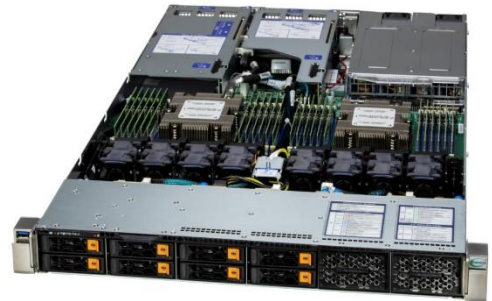
Fig. 3 Hyper A+ Server AS -1125HS-TNR