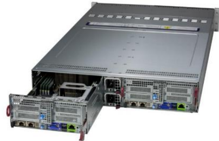
Fig. 3 Hyper SuperServer SYS-121H-TNR