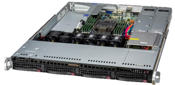
Fig. 3 UP SuperServer SYS-511E-WR