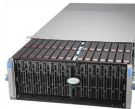
Supermicro Top-Loading 60 Bay Storage System