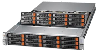
Supermicro Simply Double Storage System

Modernize your data center with storage, virtualization, and cloud technologies with Supermicro SuperStorage, Scality RING, and Veeam Backup & Replication